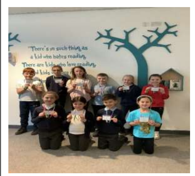
Mental Health Ambassadors